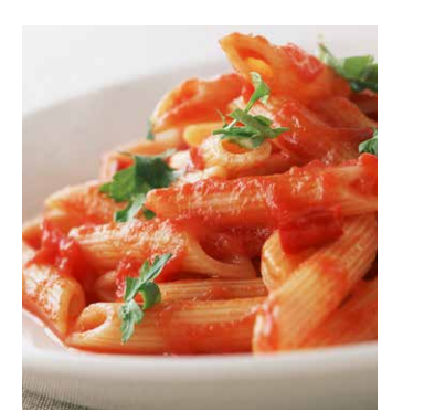
LA SCIENZA DELLE GRANDI CUCINE