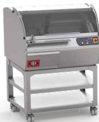
All measurements in mm.

Even easier handling: The SIRIUS+ is approx. 20% lighter than the previous model!