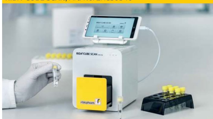
RIDA®CUBE SCAN, Art. No. ZRCS0546

Small and portable device (16 x 13 x 14.5 cm)