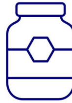
HONEY JAM MARMELADE CREAM